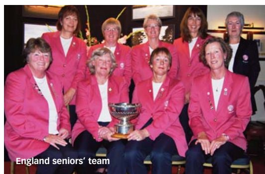
England seniors' team