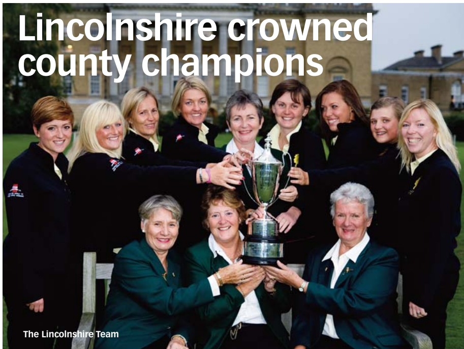
The Lincolnshire Team

Lincolnshire are England's champion county. They won the title for the first time - amid much celebration - on the last day of County Finals at Thorndon Park, Essex.